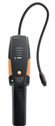
Gas leak detector testo 316-3 Order no. 0563 3163 XXX.XX €