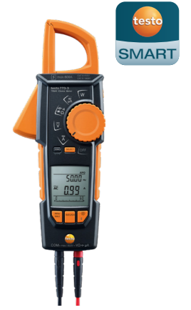
Clamp meter testo 770-3 Order no. 0590 0590 7703 XXX.XX €

Wireless vacuum probe testo 552i Order no. 0564 2552 XXX.XX € Clamp temperature probe testo 115i Order no. 0560 2115 02 XXX.XX € • Thermohygrometer testo 605i Order no. 0560 2605 02 XXX.XX € Clamp temperature probe testo 915i Order no. 0563 1915 XXX.XX € • Wireless vacuum probe testo 549i Order no. 0560 2549 02 XXX.XX €